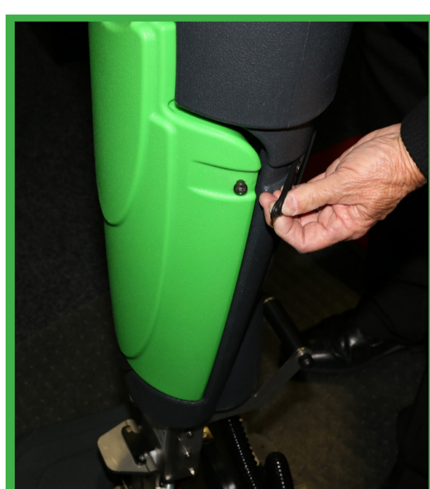
3. EMPTY THE WASTE RECOVERY TANK BY RELEASING CLIPS ON EACH SIDE.