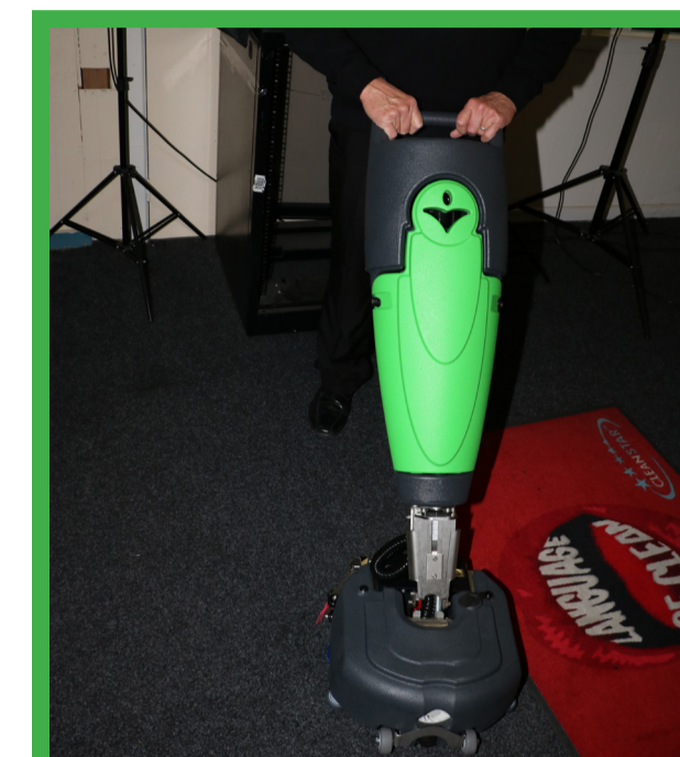
10. MACHINE IS READY FOR USE