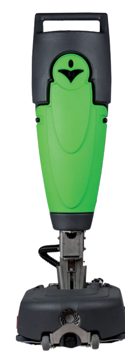
4. STAND MACHINE UP IN VERTICAL POSITION