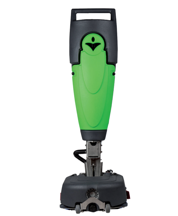
8. OK TO STORE VERTICALLY