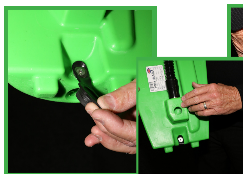
6. REMOVE DRAIN PLUG TO SAFELY RELEASE WASTE & RINSE TANK (WIPE AWAY ANY EXCESS GRIME)