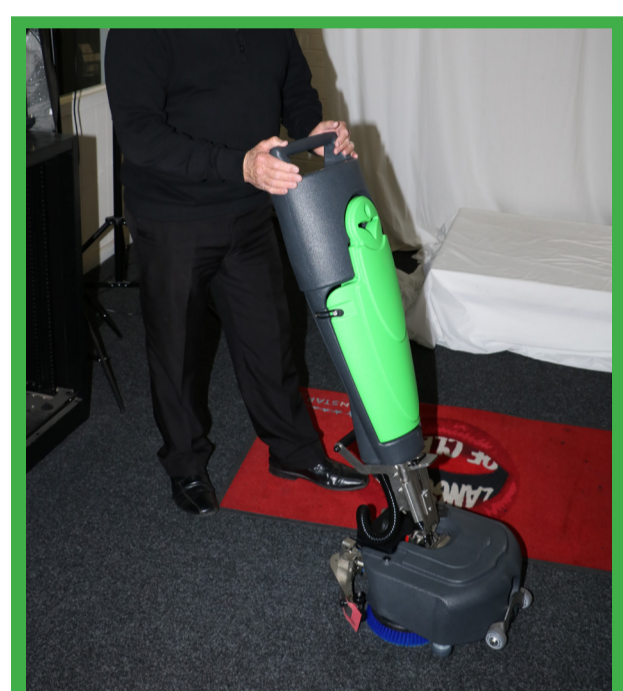
11. STAND BEHIND CONTROL PANEL