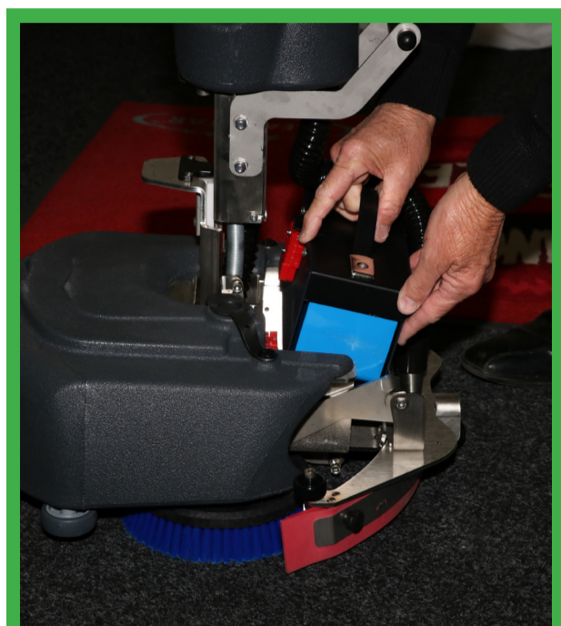
7. PLACE BATTERY INTO MACHINE