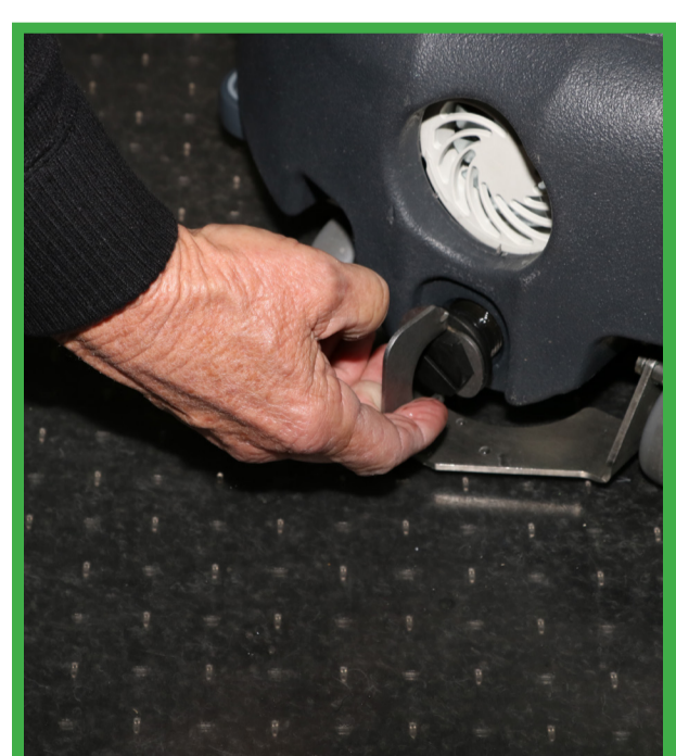
1. EMPTY THE SOLUTION TANK BY USING SPANNER SUPPLIED. TURN ANTI CLOCKWISE TO UNSCREW, REMOVING PLUG AND FILTER