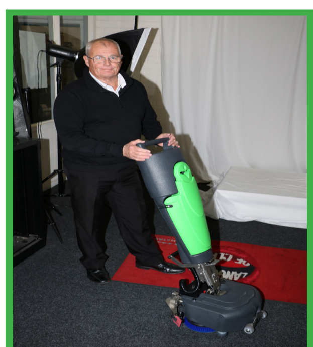
16. MAKE SURE MACHINE IS ALWAYS MOVING FORWARD, SQUEEGEE NEEDS TO FOLLOW BRUSH