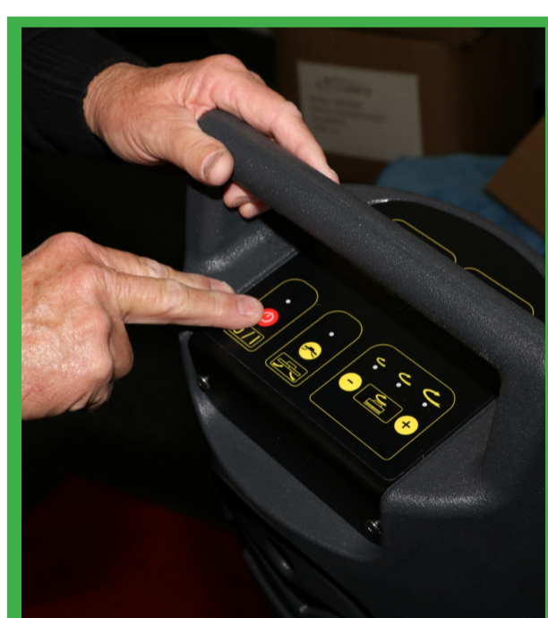
18. WHEN JOB IS COMPLETE, PRESS RED OFF BUTTON