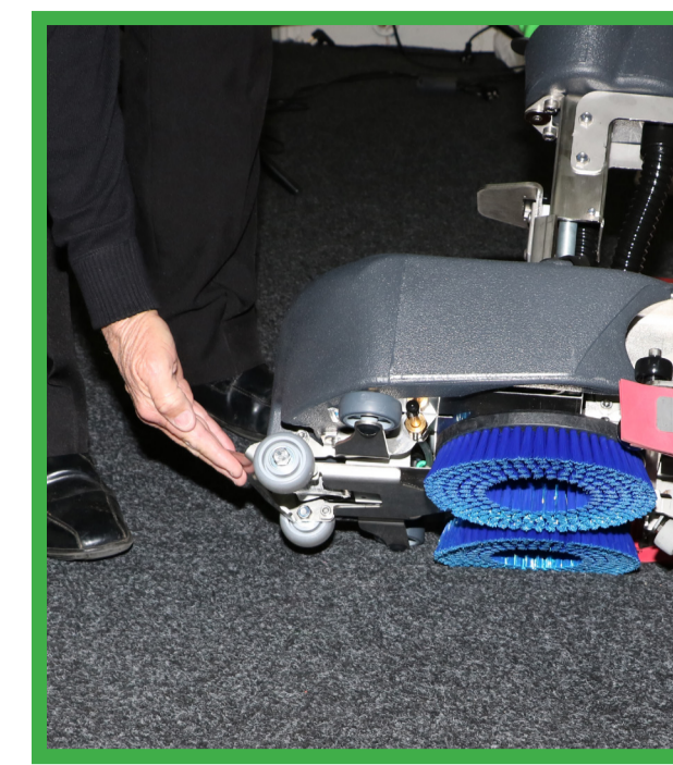
5. TILT MACHINE TO SIDE (OPPOSITE TO SOLUTION INLET) AND RAISE TROLLEY WHEELS