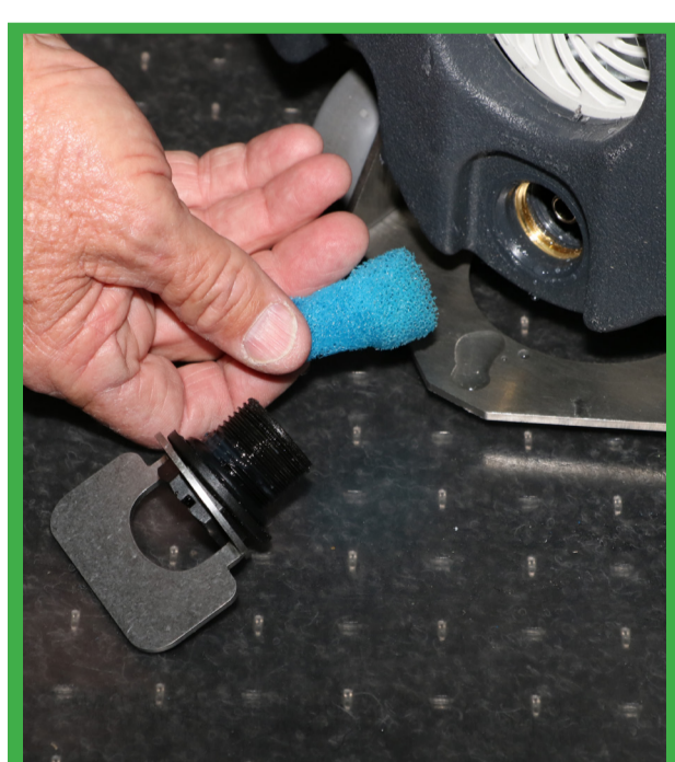
2. CLEAN THE FILTER AND REPLACE BACK INTO THE MACHINE FOLLOWED BY THE PLUG