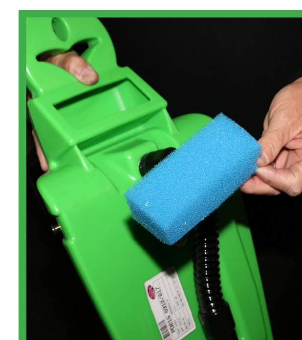
5. REMOVE TOP FILTER, WASH & REPLACE