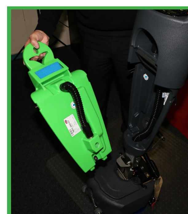
4. TILT AND LIFT TANK ASSEMBLY OUT