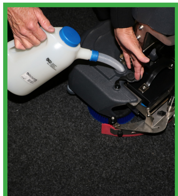
6. REMOVE INLET PLUG AND FILL SOLUTION TANK WITH CAN SUPPLIED