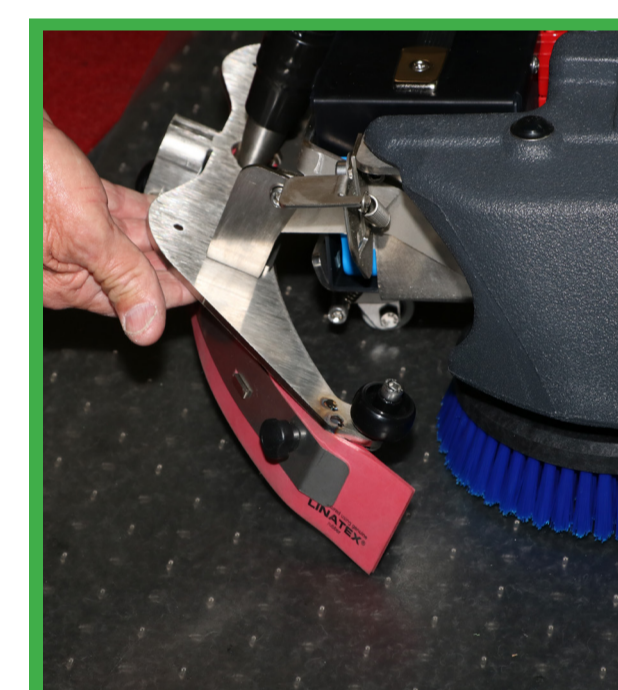
20. LIFT THE SQUEEGEE ASSEMBLY