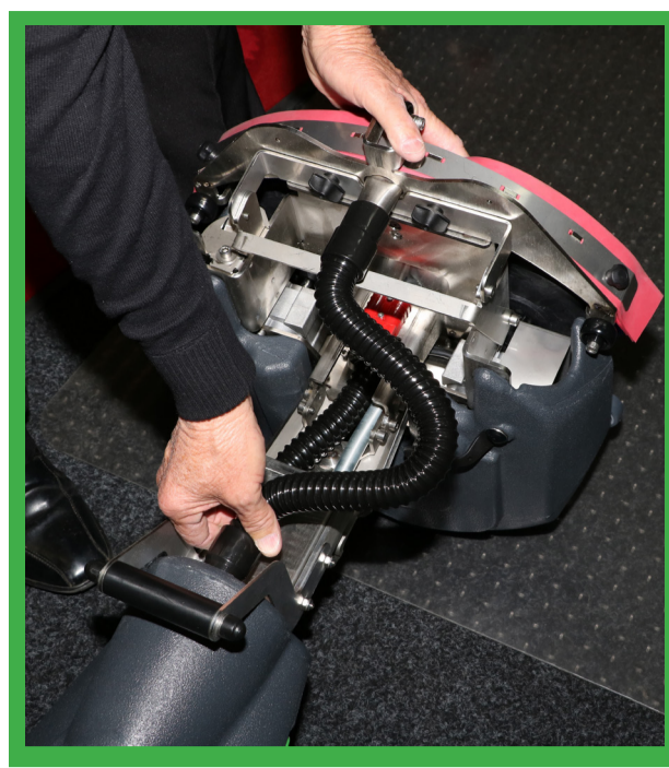
3. FIT SUCTION HOSE (FIRMLY) FROM BASE TO BODY OF MACHINE