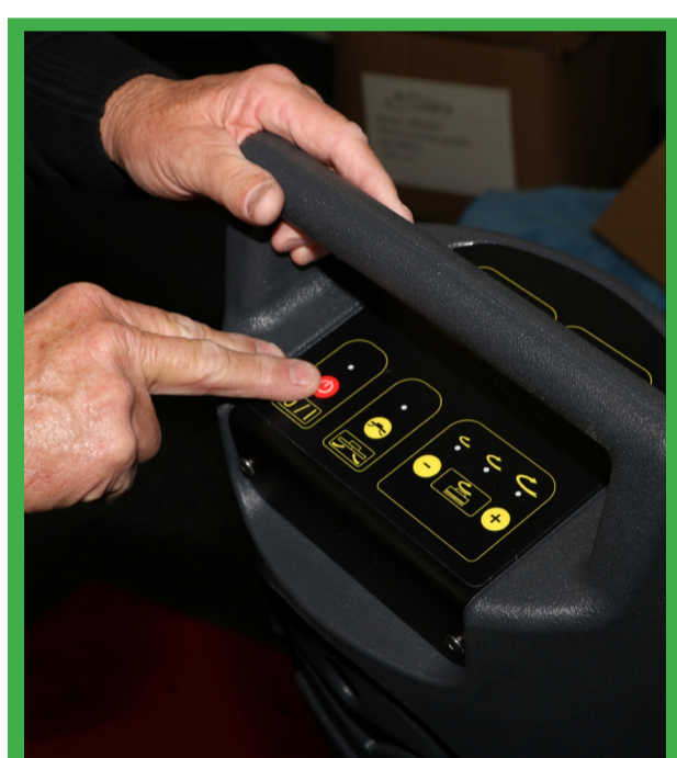
12. TO BEGIN SCRUBBING PROCESS, TURN POWER BUTTON ON