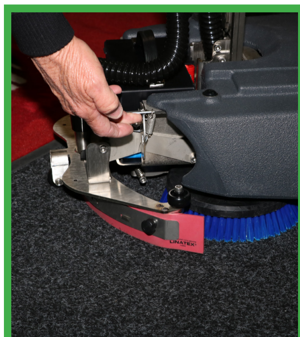
8. LOWER SQUEEGEE BY RAISING LOCKING LATCH