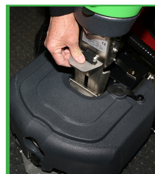
19. LIFT HANDLE TO UPRIGHT POSITION AND SECURE CONTROL HANDLE BY LOWERING SLIDE