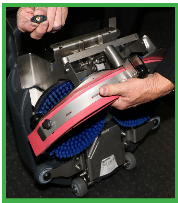
2. FIT SQUEEGEE ASSEMBLY WITH TWO WINGNUTS SUPPLIED