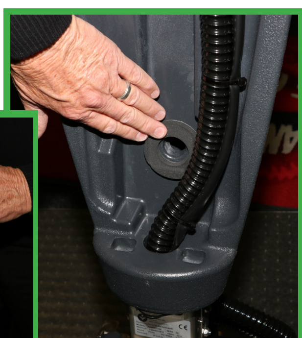
7. CLEAN EXCESS GRIME IN HANDLE BODY, BEFORE REPLACING WASTE TANK (we recommend Cleanstar Microfibre Cloth)