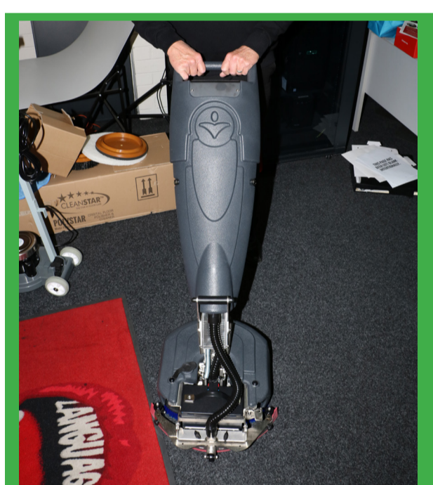
17. IF YOU WANT TO BRING MACHINE BACK TO YOU, ROTATE HANDLE AND PULL TOWARD YOU.