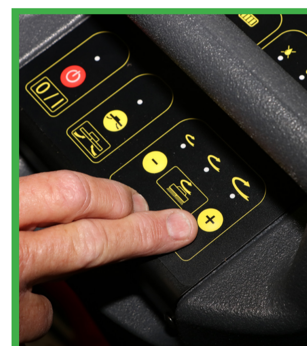
14. SELECT BRUSH SPEED CONTROL, 1, 2 OR 3