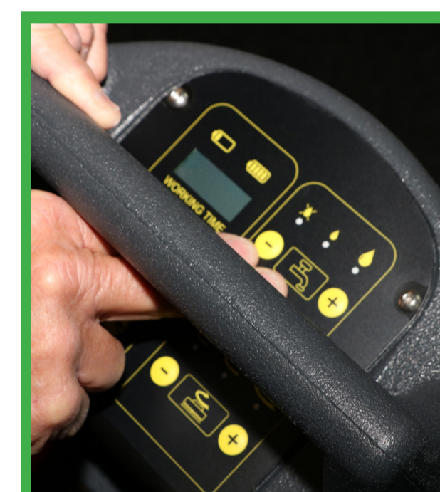
15. SELECT WATER FLOW 1, 2 OR 3