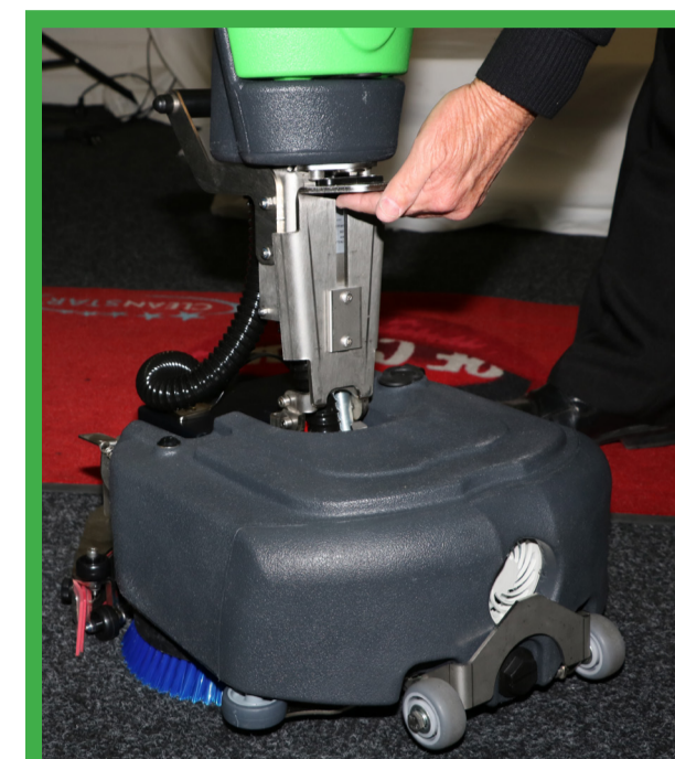
9. RAISE LOCKING SLIDE BEFORE TURNING MACHINE ON