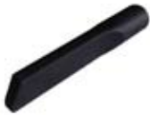
CT036 Crevice Tool