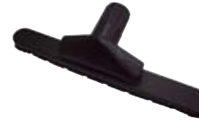
FTH136-4 Brush/Dry Floor Tool