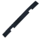
VC15L-13 Perisphere Soundproof