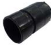
ME15 Machine End