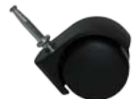
VC15L-29F Front Castor Wheel