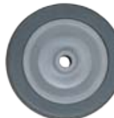
VC15L-29R Rear Wheel