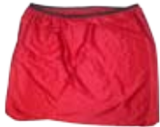
SILK-M Silk Filter Gown