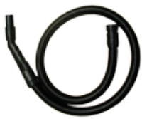
HBCOM-36 Complete Hose