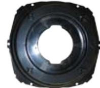
VC15L-15 Motor Cover