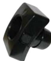
VC30L-27 Square Connector Tank