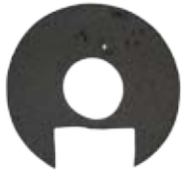
VC15L-12 Top Cover Soundproof