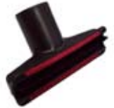
UBS036 Upholstery Brush