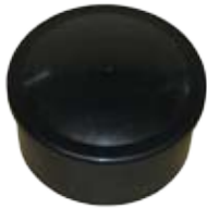
VC15L-21 Floating Ball