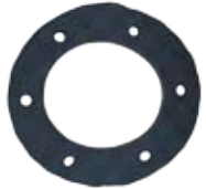
VC15L-18 Dust Screening