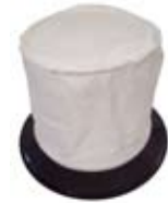
CB15/30 Cloth Bag