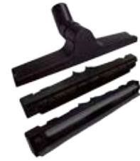
FTH136C Housing with Squeegee & Brush Inserts