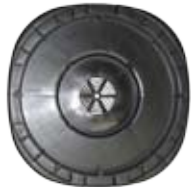
VC15L-19 Motor Base