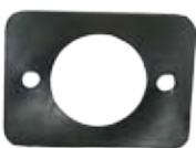
VC30L-26 Square Connector Gasket Seal