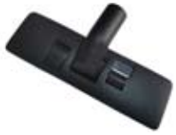
FTB136 Combination Floor Tool