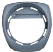
VC15L-28 Tank Base