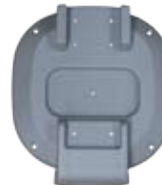
VC15L-2 Top Cover