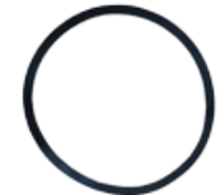
VC15L-20 Base Frame Seal Ring