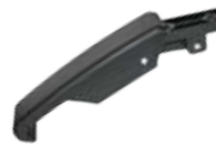
VC15L-24 Tank Clips