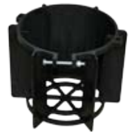
VC15L-22 Cage Float Ball Rack