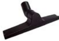
FTH136 Multipurpose Housing