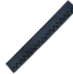
VC15L-14 Motor Soundproof