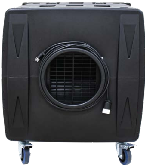
12" Exhaust Collar