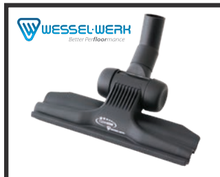
Wessel-Werk 32mm Low Profile Floor Tool