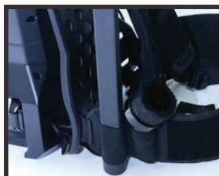
Convenient tool storage on waist strap