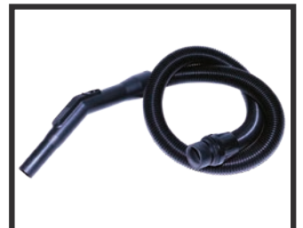
Flexible vacuum hose assembly