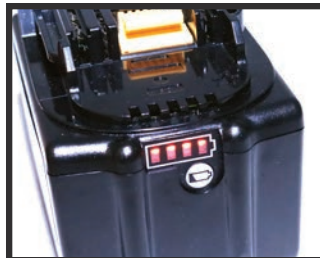
Battery indicator light