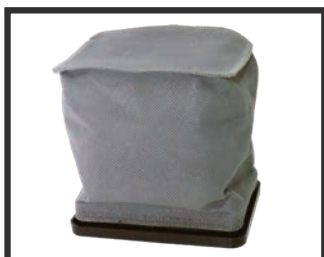
Cloth filter bag - 5L