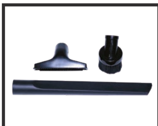
Long crevice nozzle, dusting brush and upholstery tool