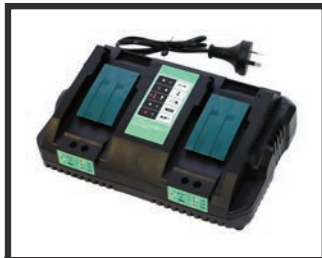
Battery charger station