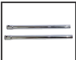
2 x 32mm extension rods