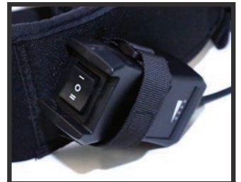
Easy access 2-speed switch attaches to waist strap