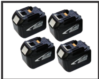
2 sets of rechargeable lithium-ion batteries (4 in total)