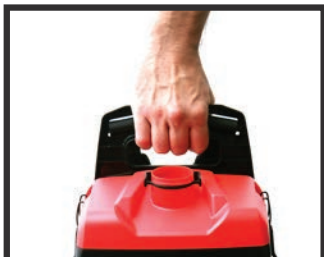
Convenient carry handle for easy transportation