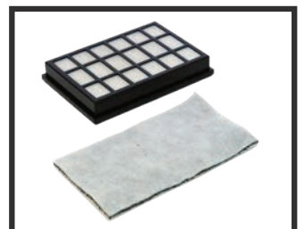
Pre-motor filter & H13 HEPA exhaust filter