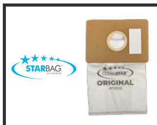
Disposable dust bag - 4.5L (Uses Starbag AF950S)