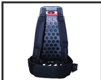
Comfortable harness assembly with strong velcro waist strap