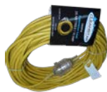
18 Metre Extension Lead