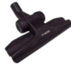
Wessel-Werk Low Profile Floor Tool